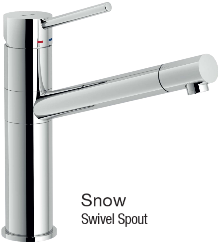
Snow Swivel Spout